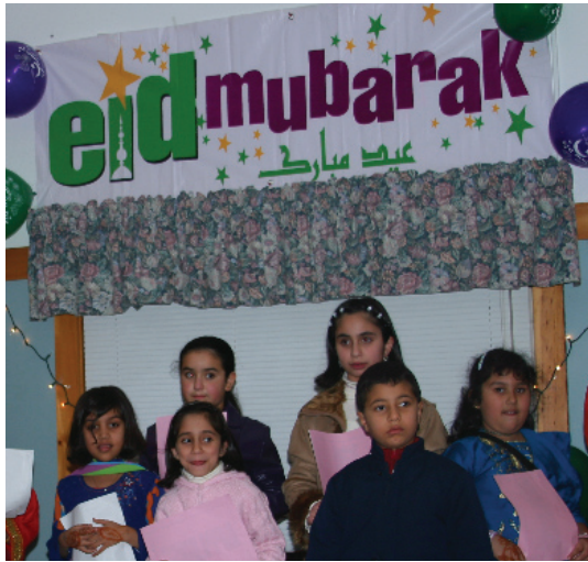
Kids celebrating Eid Ul-Fitr 2004

Muslims in St. John's meet daily in the Mosque for the evening prayers. Every Saturday, they meet for the evening meal (Iftar). At the end of Ramadan, they will celebrate Eid- ul-Fitr (the celebration of ending the fast) with prayers and a social gathering.